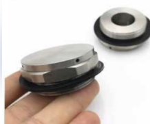
Battery Pack Application