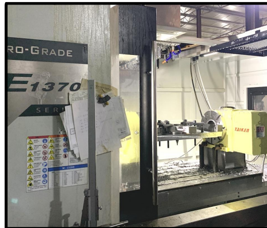
4 Axis CNC