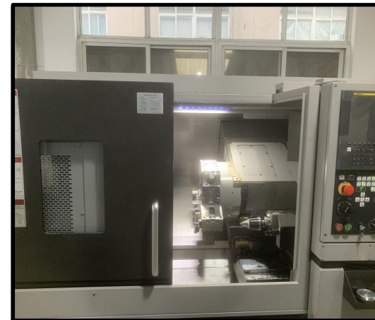
Oblique Guide CNC Lathe