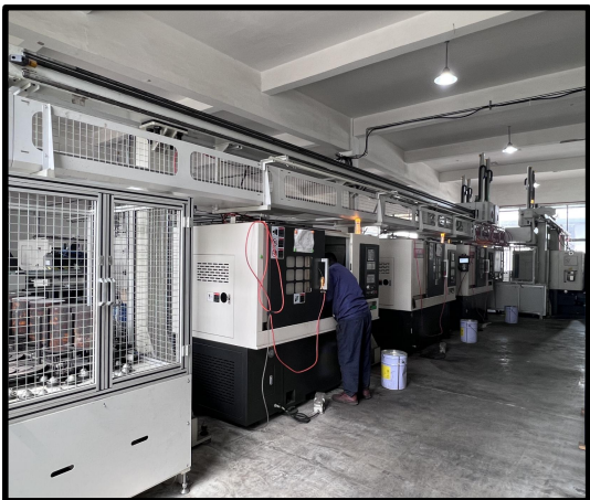
Automatic Mechanical Arm Production Line

Machining Accuracy: \pm 0.005\text{mm} to \pm 0.01\text{mm}